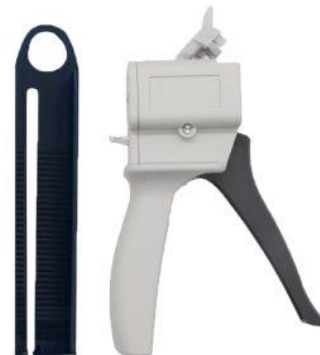
Part # DG050-10 (50ml)