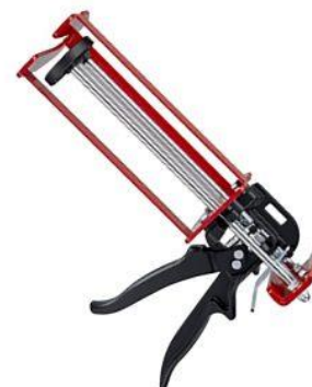
Part # DG490-10 (490ml)