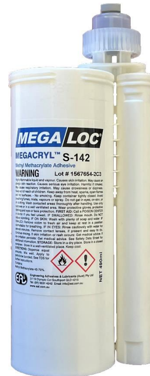
Part # S142490